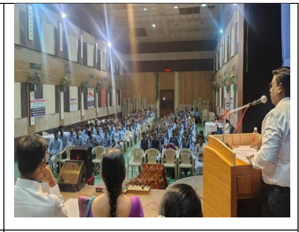
Inauguration ceremony of health checkup camp organized by Shri R. L. T. College of Science, Akola