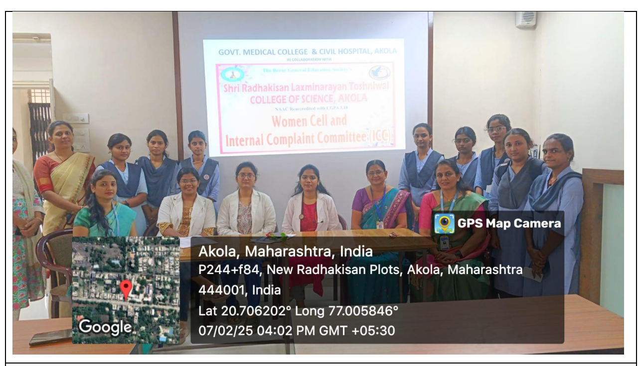
The entire Team of Women Cell and ICC with all the Doctor Professionals (OBGY)