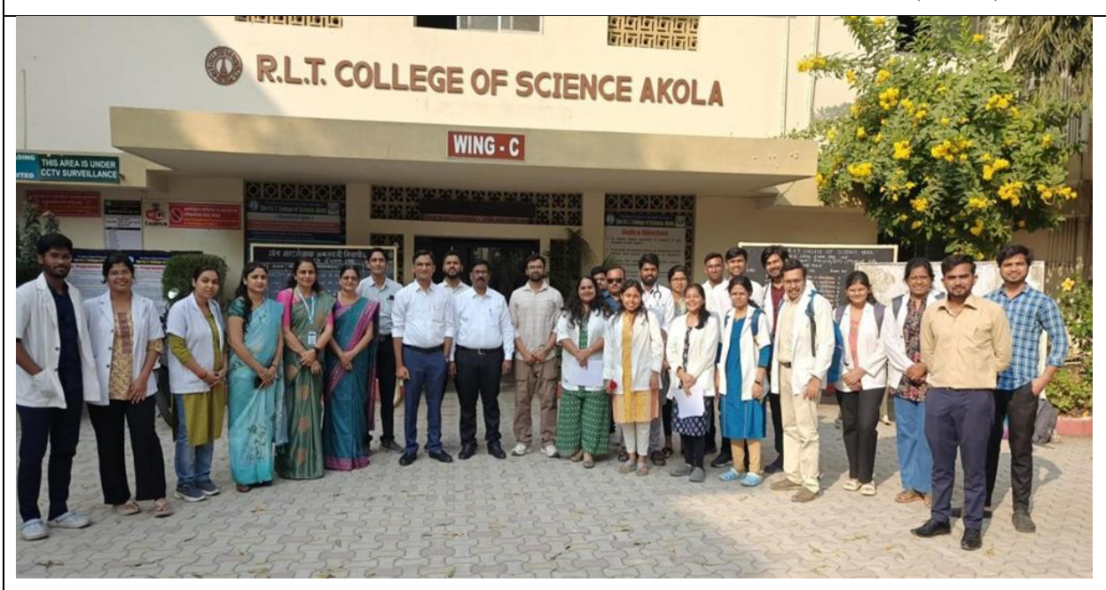
The Entire Team of Doctors Teachers and staff of the Health Checkup camp.