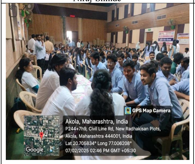
Boys interacted with the doctor professionals and experts.