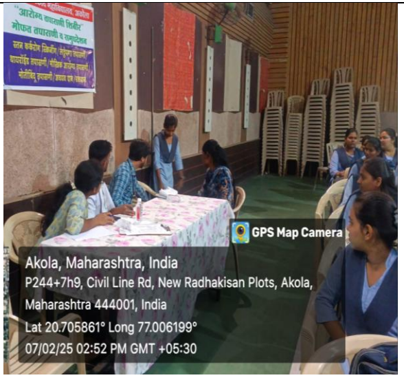
Student doing general body checkup and Body weight.