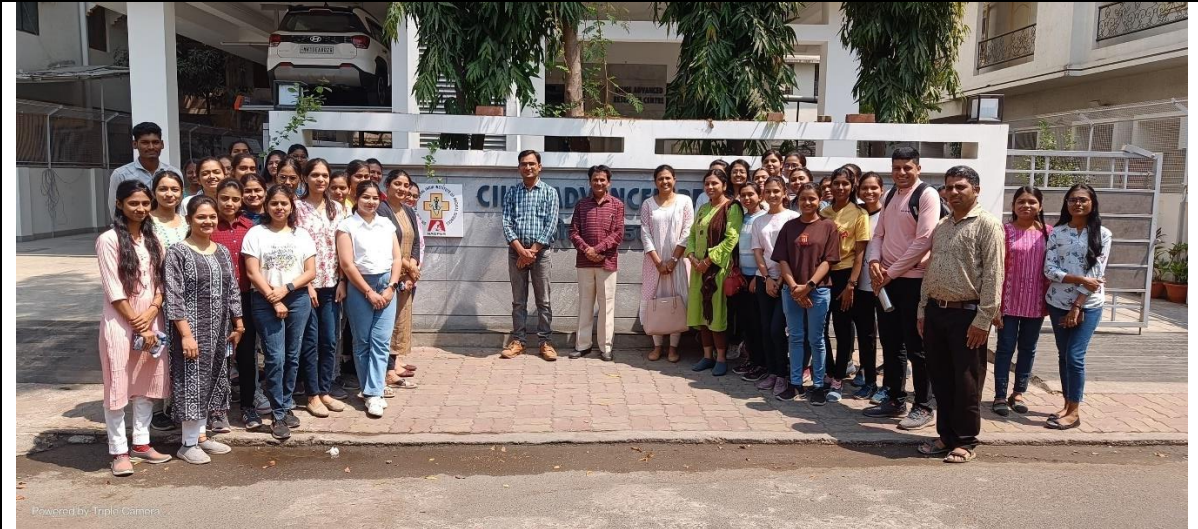
Staff And Students At CIIMS Advanced Research Centre, Nagpur