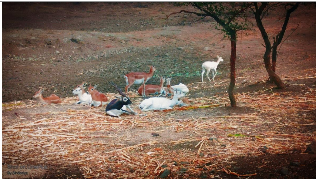
Animals at the Balasaheb Thackeray Gorewada International Zoological Park