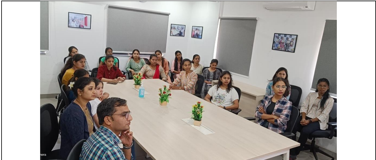
Staff And Students At The Interaction With Researchers At CIIMS