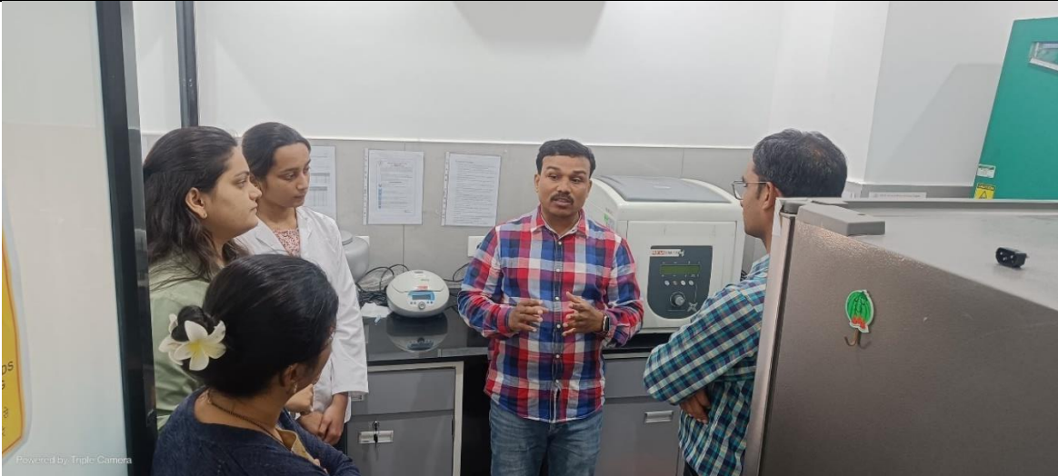
Staff At CIIMS Explaining The Students