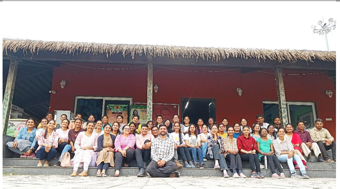
At The Balasaheb Thackeray Gorewada International Zoological Park