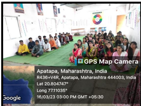
Students present for the program