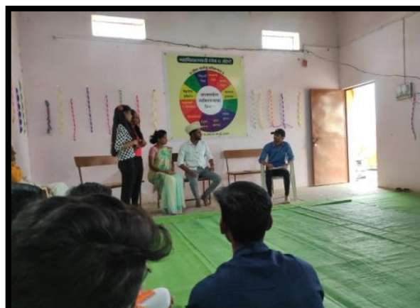
Students presented a play