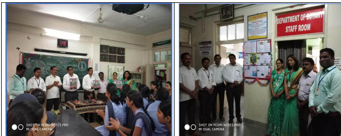
Release of First issue of Wall Magazine BESST

The Wall Magazine BESST (Biological and Environmental Studies with Social Temperament) is an innovative participatory learning project for B.Sc. Biology students. It is a launch pad for the student's creative urges to blossom naturally. As the saying goes, mind like parachute works best when opened. This humble initiative set the budding minds free allowing them to roam free in the realm of experience to create a living world in words. Our student authors have put across some amazing pieces of writing in this Wall Magazine.