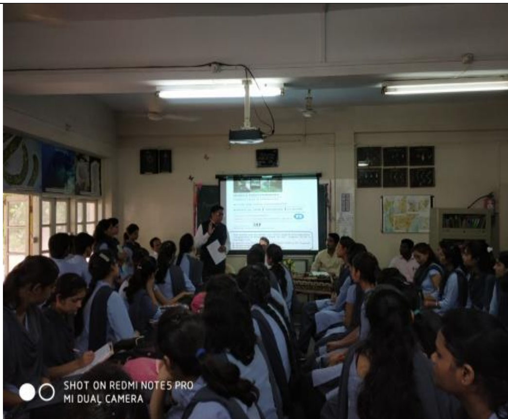
Expert's guidance about various techniques of nature and wildlife photography