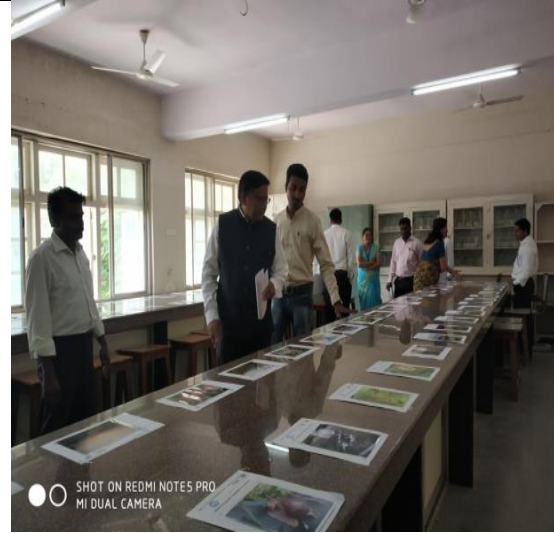
Mobile photography competition and exhibition: Session 2018-19