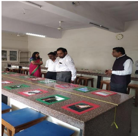
Mobile photography competition and exhibition: Session 2019-20