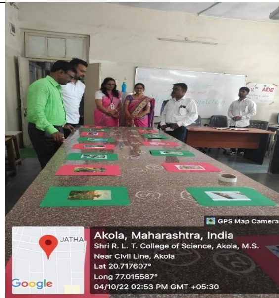
Mobile photography competition and exhibition: Session 2022-23