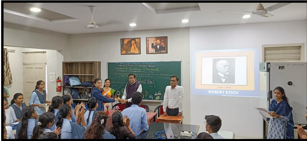
Felicitation Of The District-Level Winners Of 'Avishkar'