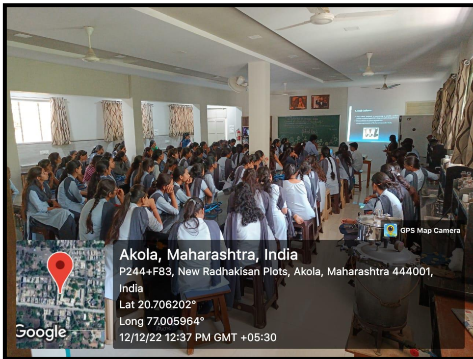
Participants Delivering Seminars