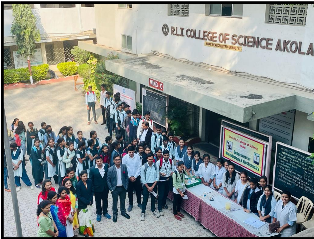
Candidates And Organizing Committee At The Camp