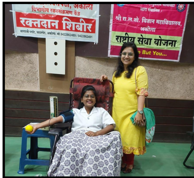
Staff And Student of Department of Microbiology & Biochemistry Donating Blood