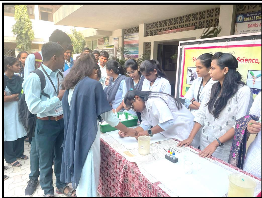
Volunteers Checking The Blood Group