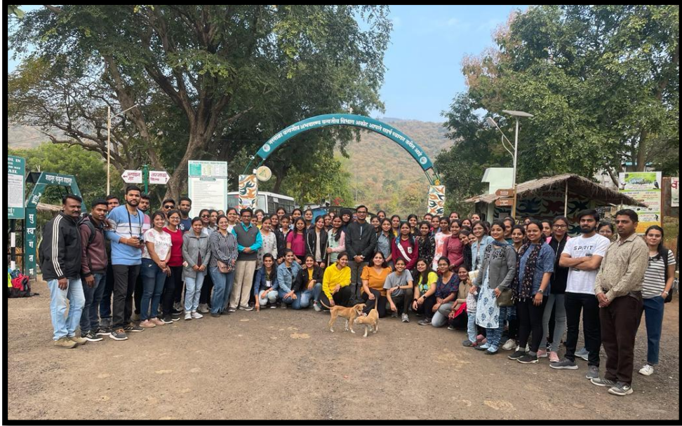
All Students And Staff At The Narnala Wildlife Sanctuary