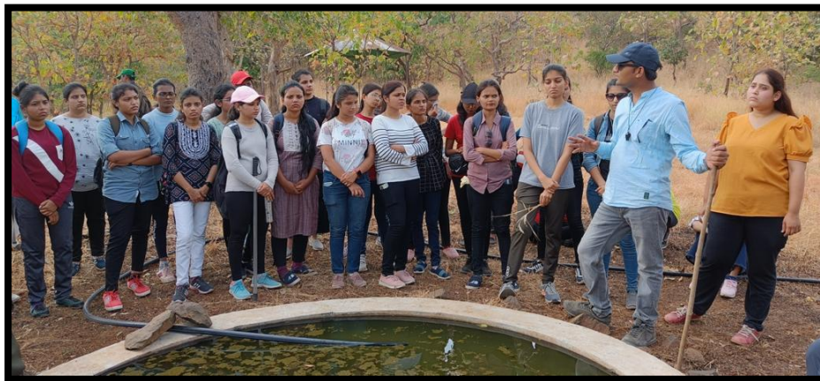
The Trek On Narnala Fort