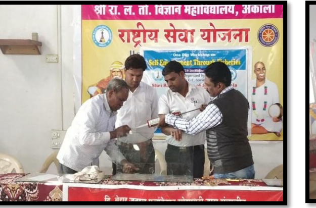
Demonstration about Construction of Aquarium