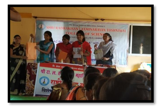
Demonstration about the making of paper bags