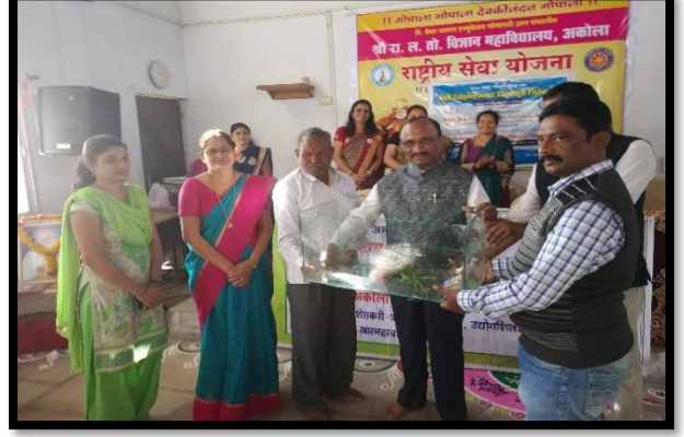
Gifting Aquarium to college