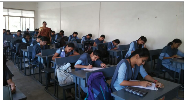
Zoology Aptitude Test arranged for the B.Sc.III students