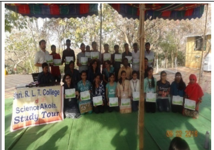
Winners of the "Biodiversity Quiz" competition.