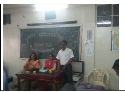
Celebrated World Wild Life Day at Department