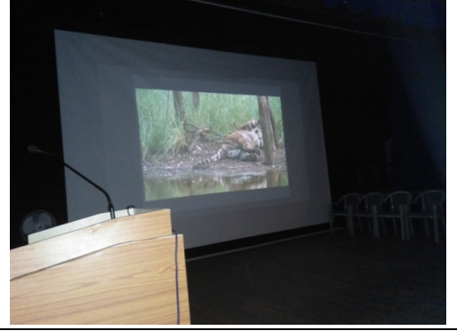
Documentary show "Save the Tiger" for the students