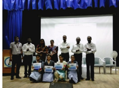
Digital Gallery Inauguration Programme