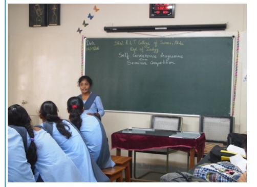
Students Delivered Seminar in the Zoology Lab. on Self Governance Day, Teachers Day (5th September)