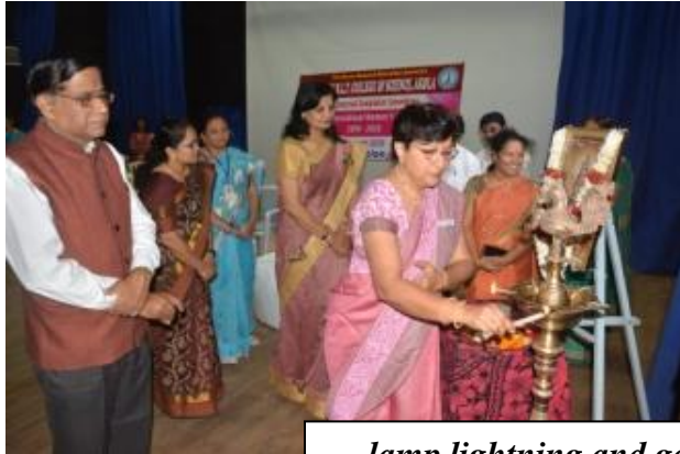
Photo coverage of a Program “Celebration of International Women’s day” on Saturday 7 th Mach 2020