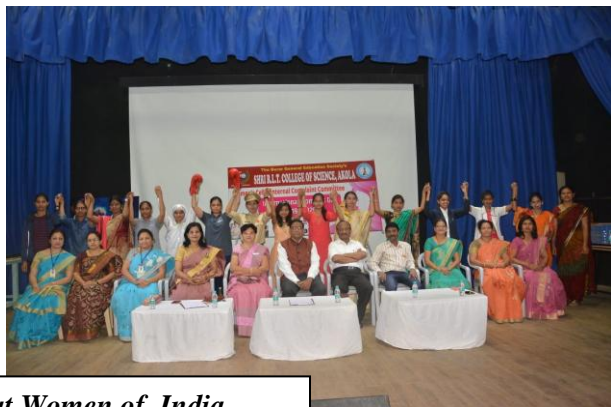
A Tribute to Great Women of India