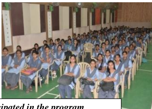
Students participated in the program