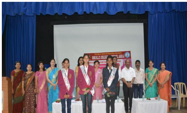
Women’s Champions of Shri R.L.T. College of Science, Akola