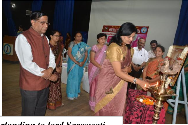
lamp lightning and garlanding to lord Saraswati