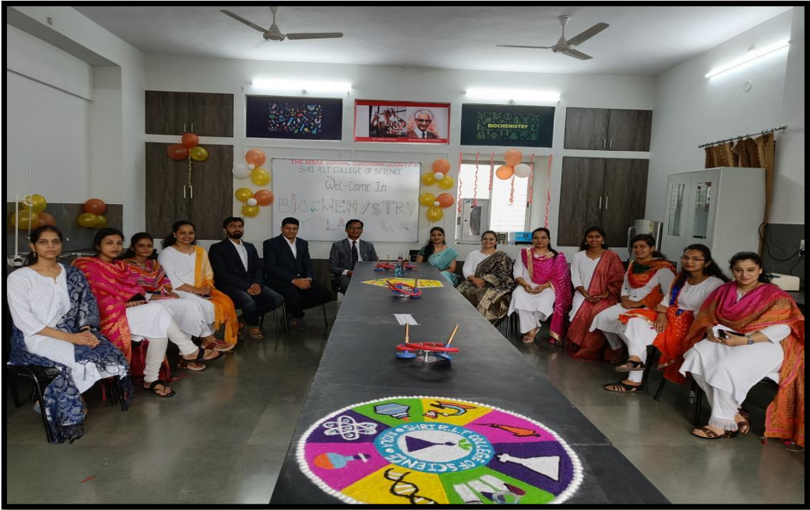
Staff of Department of Biochemistry & Microbiology