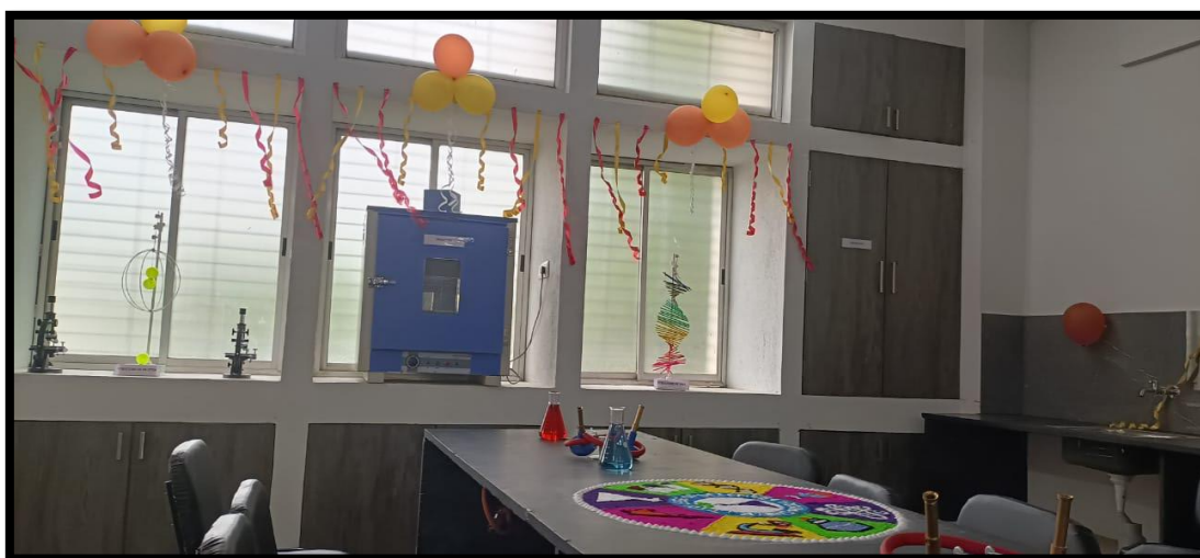
New laboratory of PG Biochemistry