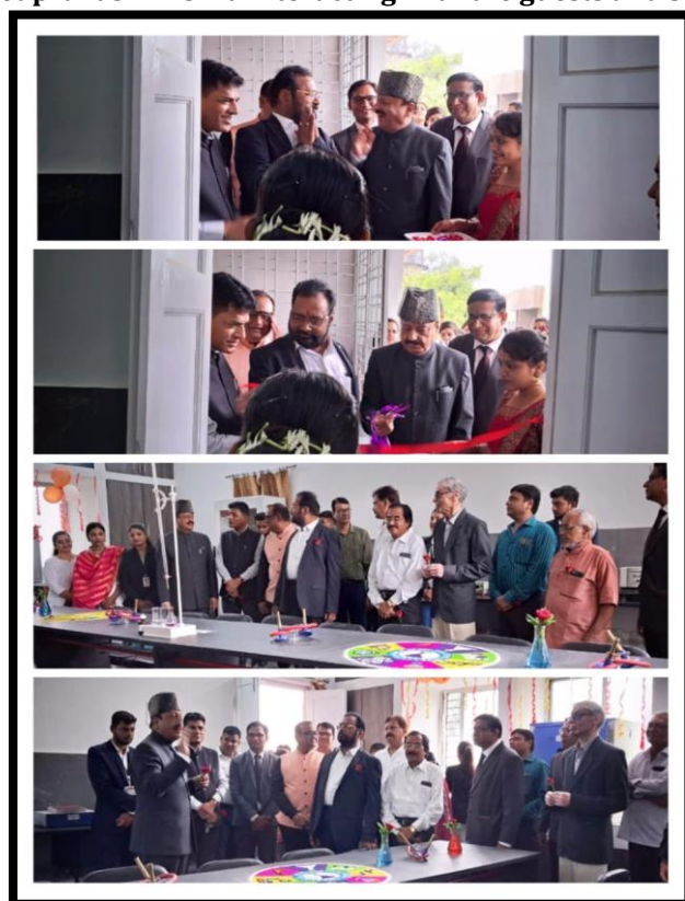
Guests in the new laboratory of PG Biochemistry