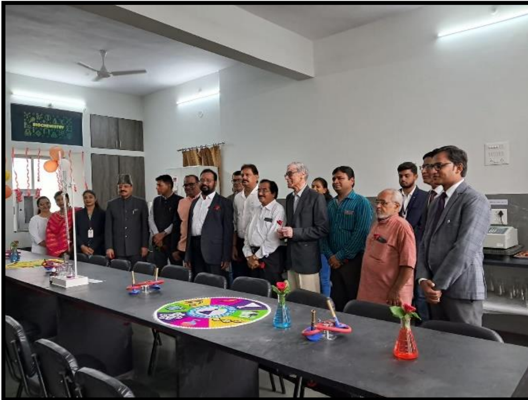
All the inaugurators and guests in the new PG Biochemistry Laboratory