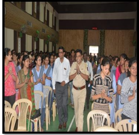
Welcoming the Guests in the Auditorium.