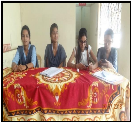
Registration counters for girls