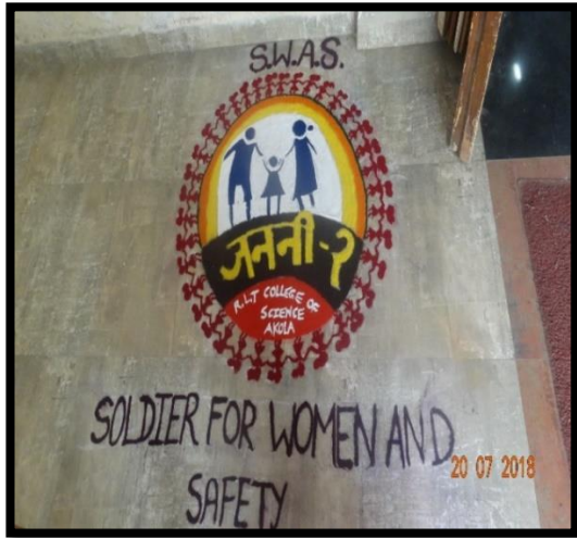
Rangoli drawn by the students.