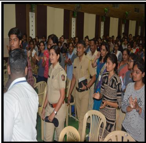
Warm welcome by students.