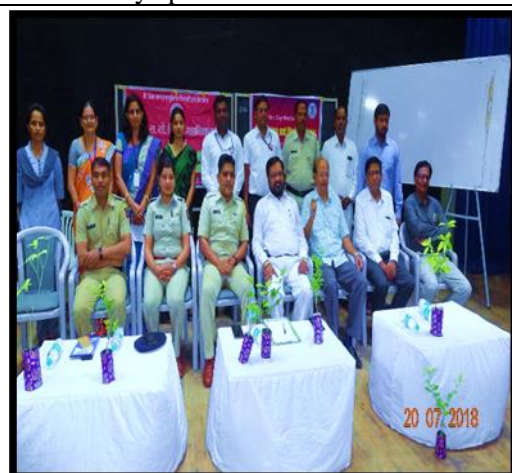
Dignitaries on the dais with organizing committee.