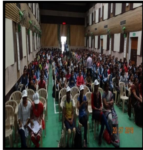
Participants in the auditorium.