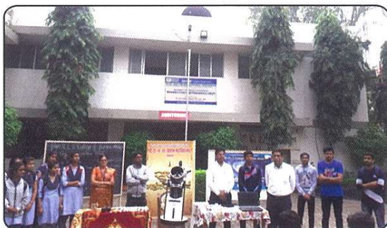
'Solar Eclipse Observation' Programme Organized by Sky Observation Club