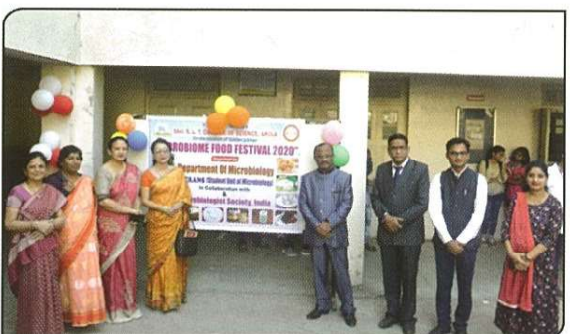
International Guest Lecture and 'Microbiome Food Festival' Organized by Department of Microbiology