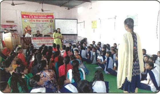
रा.से.यो.विशेष शिबीर ग्राम आपोती (खु.) येथे आयोजित 'मासिक पाळी एक वरदान' मार्गदर्शन कार्यक्रम