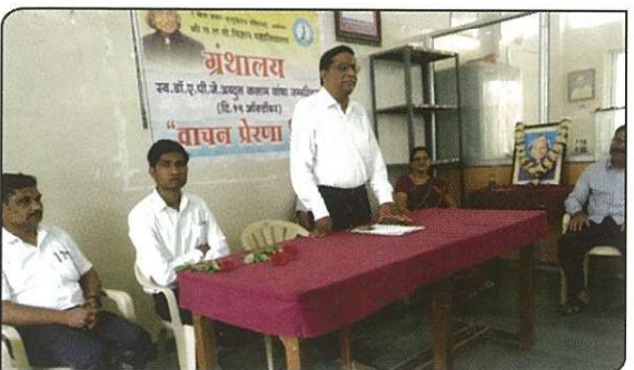
'Vachan Prerna Divas' Organized by Library & Information Centre