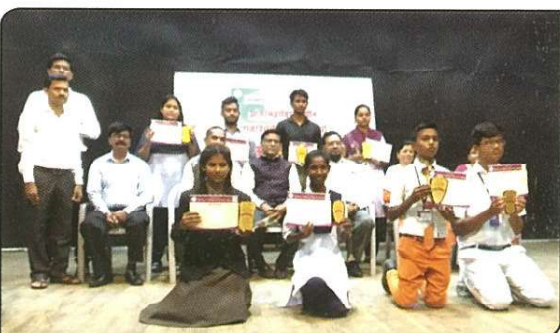
Elocution Competition organized by Department of Languages and Library