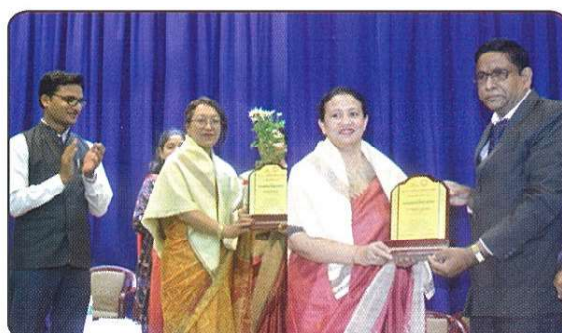
Felicitation of Speakers during 'International Guest Lecture' Organized by Department of Microbiology