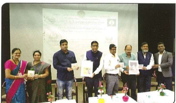
Release of E-Manuals Prepared by Department of Zoology