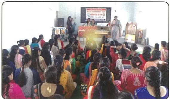
रा.से.यो.विशेष शिबीर ग्राम आपोती (खु.) येथे आयोजित 'आजीचा बटवा' कार्यक्रम अंतर्गत माहेलांशी संवाद साधतांना