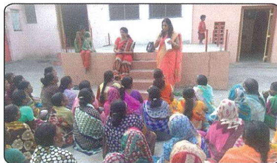
दत्तक ग्राम आपोती (खु.) येथे रा.से.यो. द्वारा आयोजित 'कोरोना' विषयक मार्गदर्शन' करतांना