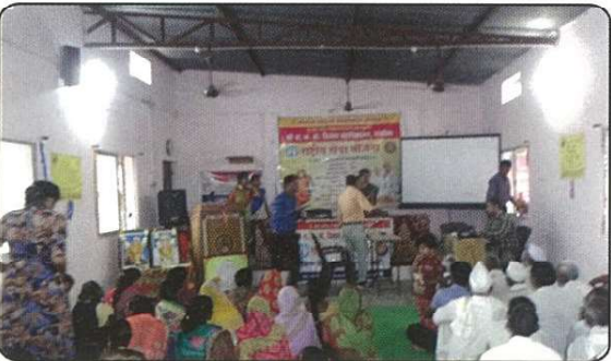
रा.से.यो.विशेष शिबीर ग्राम आपोती (खु.) येथे आयोजित 'मोतिबिंदू मुक्त गाव' अंतर्गत गावकऱ्यांची तपासणी