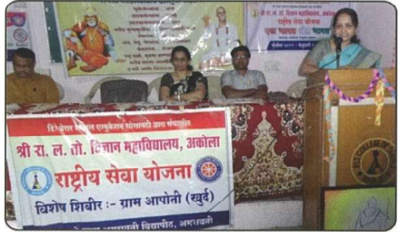
रा.से.यो.विशेष शिबीर ग्राम आपोती (खु.) येथे आयोजित 'महिला कायदेविषयक मार्गदर्शन' कार्यक्रम