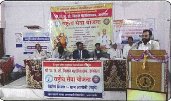
रा.से.यो.विशेष शिबीर ग्राम आपोती (खु.) येथे जिल्हा विधी सेवा प्राधिकरण, अकोला द्वारा आयोजित 'कायदेविषयक मार्गदर्शन कार्यक्रम'