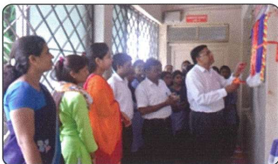
Inauguration of 'Bioinfo Club' & 'Bioinfo Wall Magazine'