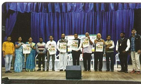
Publication of 'Biodiversity Calender - 2020'