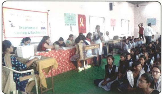
रा.से.यो.विशेष शिबीर ग्राम आपोती (खु.) येथे सुक्ष्मजीवशास्त्र विभागाद्वारे आयोजित 'रक्तगट तपासणी शिबीर'