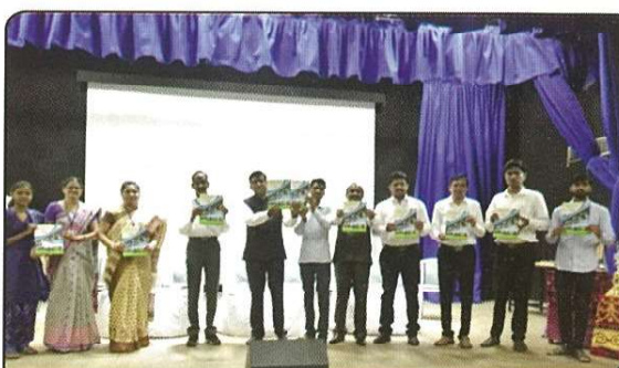
Publication of College Annual Magazine 'Pratibimb'