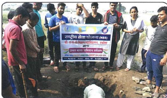
रा.से.यो.विशेष शिबीर ग्राम आपोती (खु.) येथे श्रमदान अंतर्गत 'शोष खड्डे' तयार करतांना रा.से.यो. स्वयंसेवक