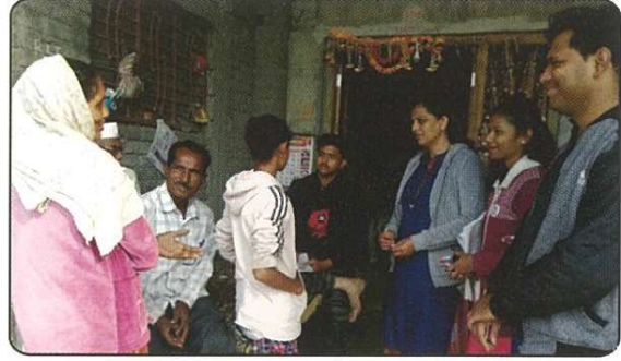
रा.से.यो.विशेष शिबीर ग्राम आपोती (खु.) येथे आयोजित 'ग्रामविकास व उन्नत भारत' कार्यक्रम अंतर्गत पारिवारीक माहिती गोळा करतांना रा.से.यो. कार्यक्रम अधिकारी व स्वयंसेवक