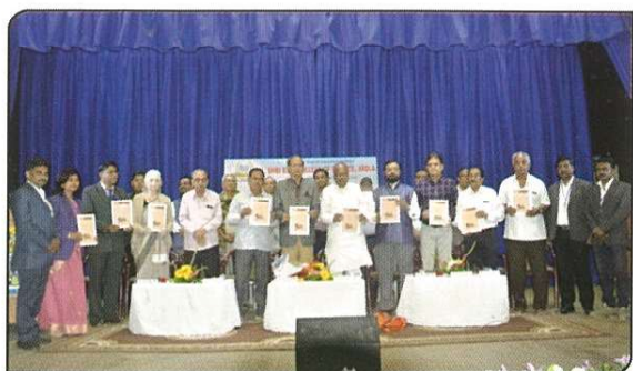
Publication of College Science Magazine 'infoSCIENCE'