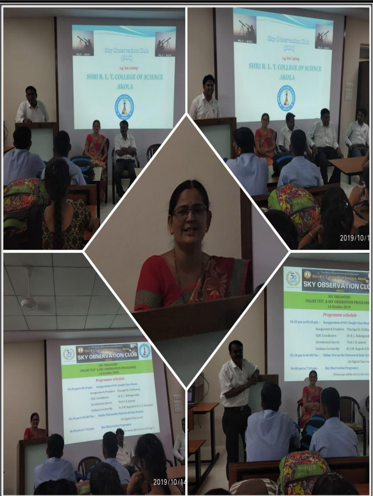
Introductory Lecture On Astronomy And Inauguration Of SOC-Google Class Room