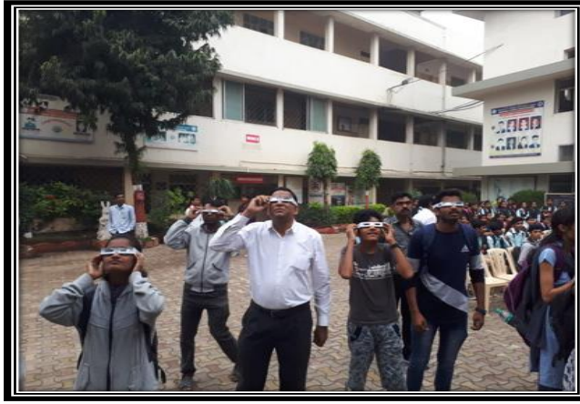
Students Watching Solar Eclipse