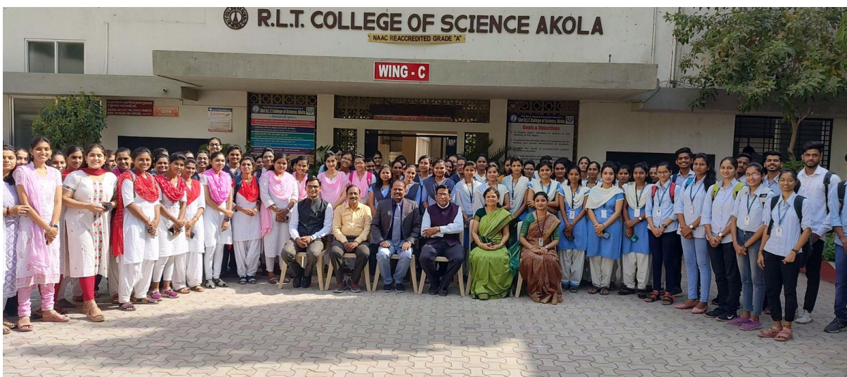
Photo: Participants, Staff, and Resource person of Skill Development workshop