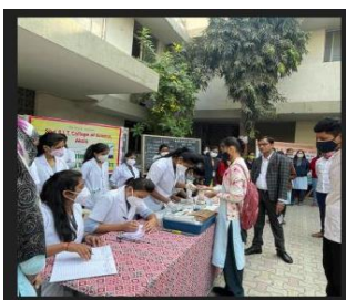
Photo: - Blood Grouping