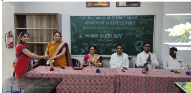
Photo: - World Earth Day celebration at Department