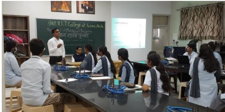
Photo: - National Science Day celebrated by Department