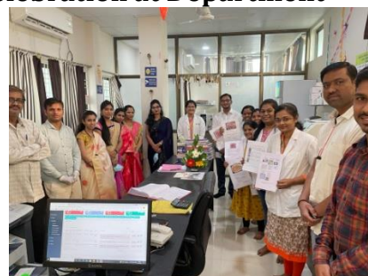
Photo: - Project submission at Dr. Hedgewar Hospital and research Centre (Akola)