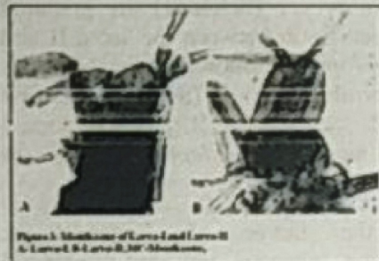
Figure 3: Mouthparts of Larva-I and Larva-II A- Larva-I, B- Larva-II, MP- Mouthparts.

Prepupa: Body is bright red in colour and cylindrical in shape tapering posterior. The body measures about 2.54 \pm 0.17 mm in length. The last abdominal segment is slightly darkish. Body is covered with a thin soft integument. The appendages show glassy texture (Fig. 1D). The antenna is short horn-like and unsegmented, situated on the frontolateral side with pairs of long thin setae at the front of each antenna. Antennae are distinctly clear and somewhat transparent (Fig 2C) The mouthparts are indistinct difficult to observe even in preserved condition. The thorax is compressed dorsoventrally and somewhat flattened, distinct from the head and is clearly demarcated. The abdomen is broad anteriorly while tapering towards the posteriorly.