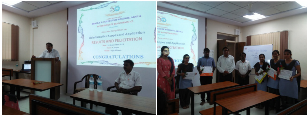
Winner students with Principal and Department Head and Faculty