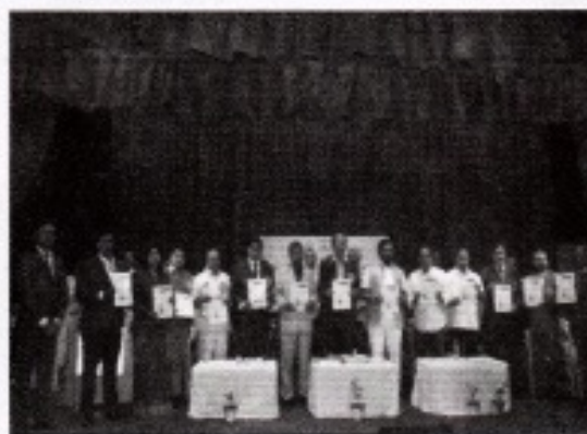
State Level Seminar on My Health My Responsibility : Complimentary to Medicine and Health care Organised by Dept. of Microbiology on 28th Feb 2019.