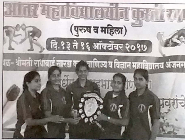
S.G.B. Amravati University Wrestling Championship Winner Team