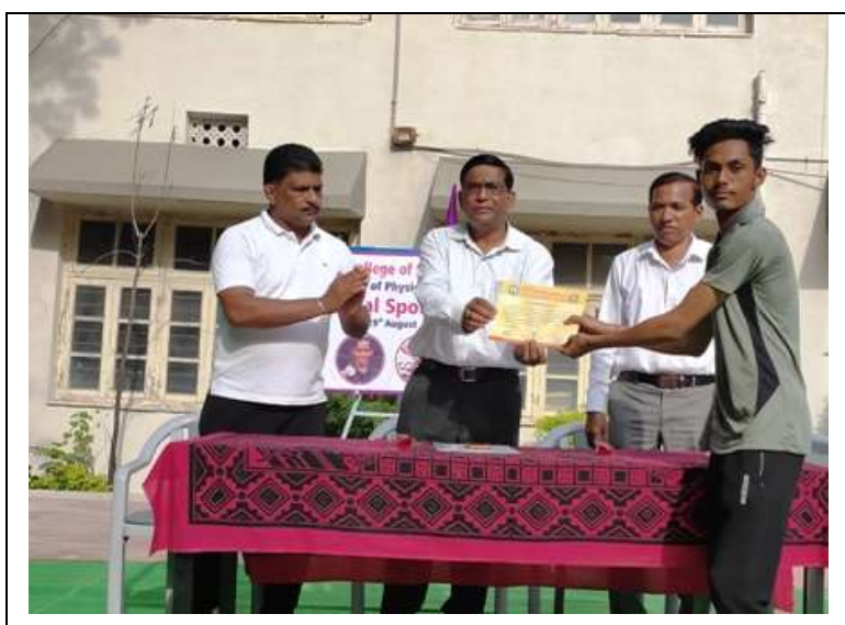
National Sports Day Felicitation Programme