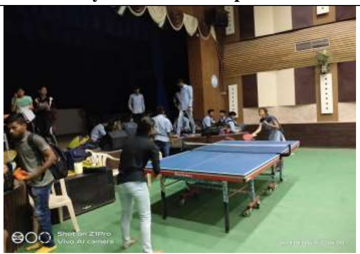
Table Tennis Tournament