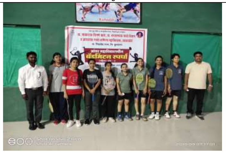
Badminon (Women) Late Bhaskarrao Shingane Arts College, Sakharkherda Dist.Buldana