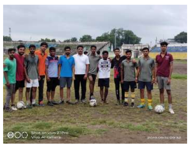
Football- Lal Bahadur Shastri Stadium