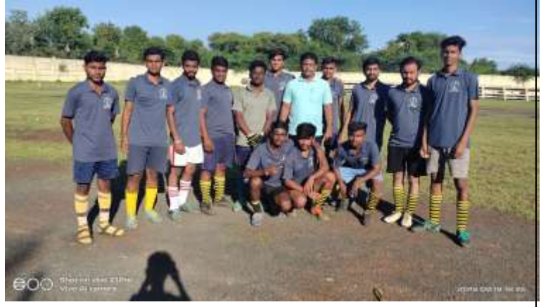
Football Mungsaji Maharaj Mahavidyalaya, Darwha Dist. Yavatmal