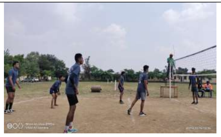
Volleyball Ramrao Zanak College, Malegaon Dist. Washim