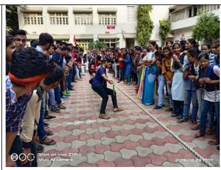
National Sports Day - Tug of War