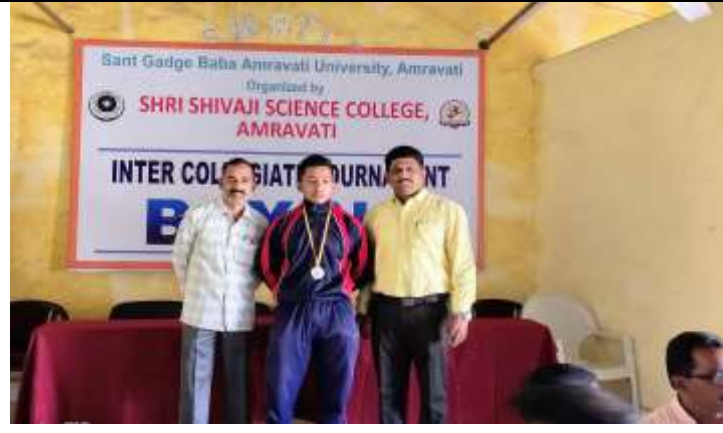
Boxing (Men) Shri Shivaji Science College, Amravati