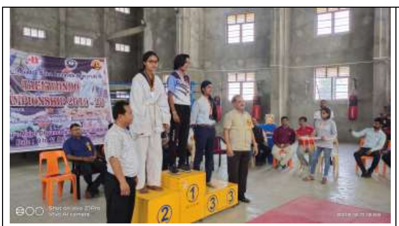
Taekwondo Degree College of Physical Education (HVPM) Amravati