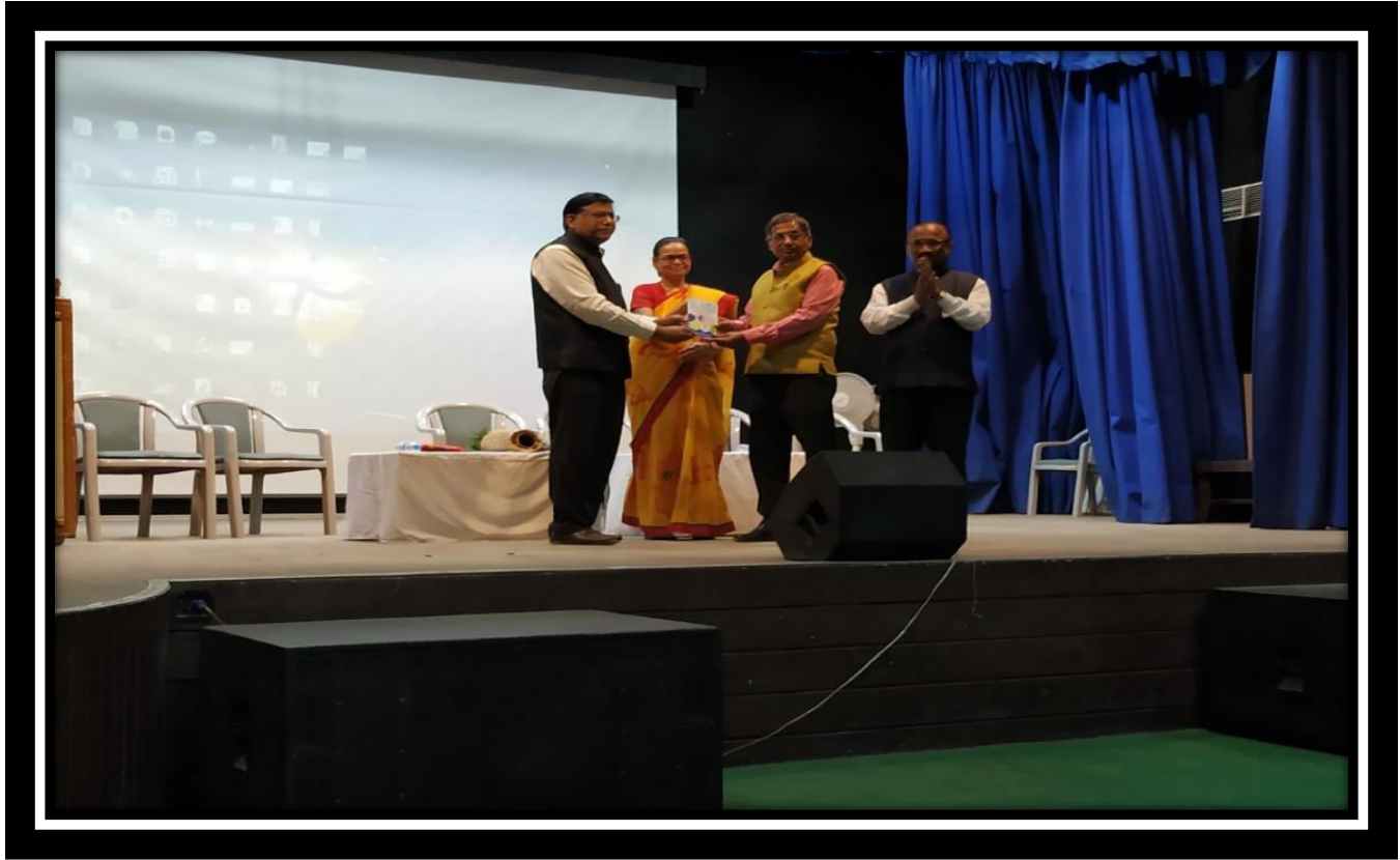
Guest Lecture organized by MICRANS