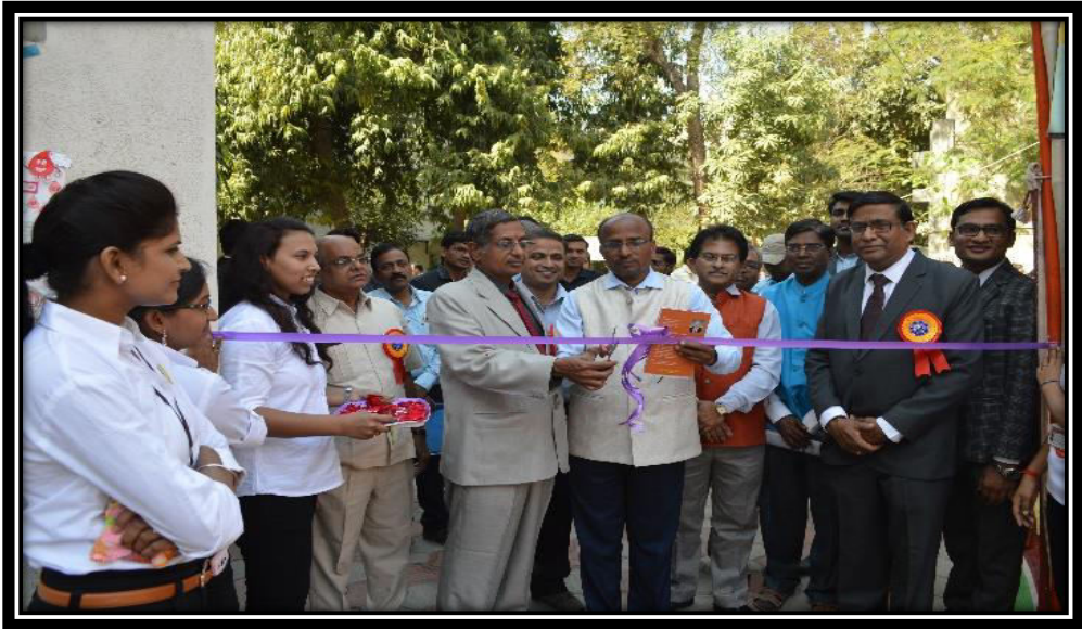
Issue Addressed: Propagation of scientific temperament