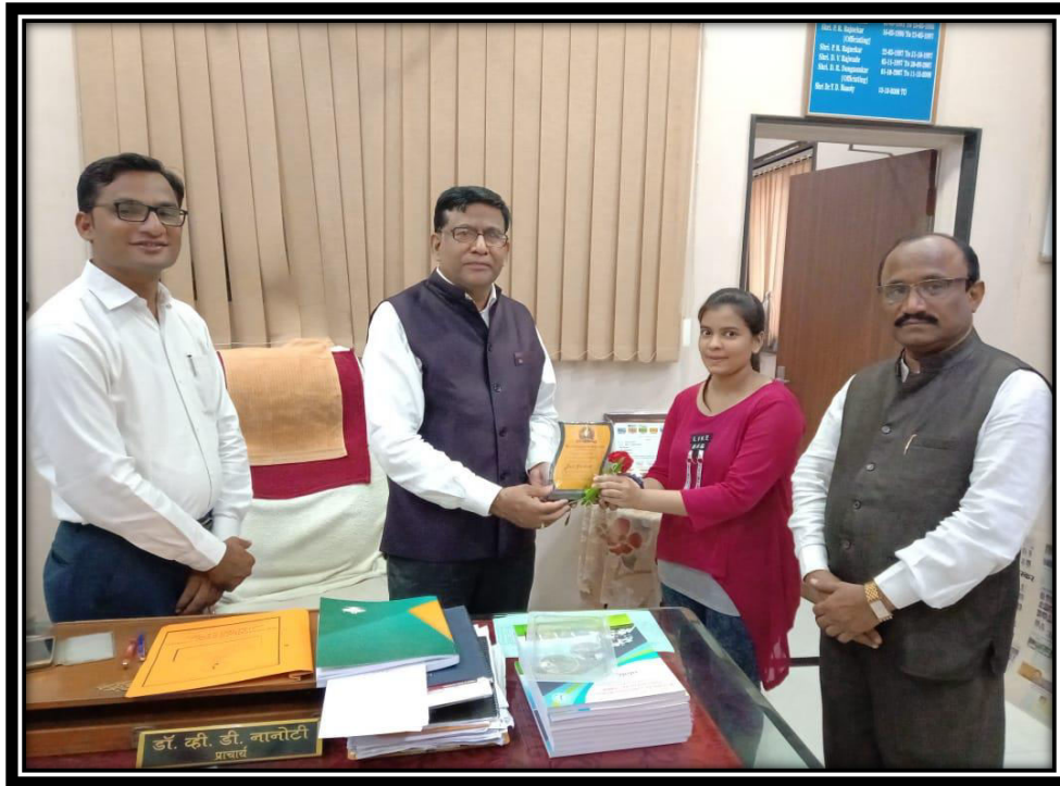
U. G. BEST STUDENT AWARD,(MSI)