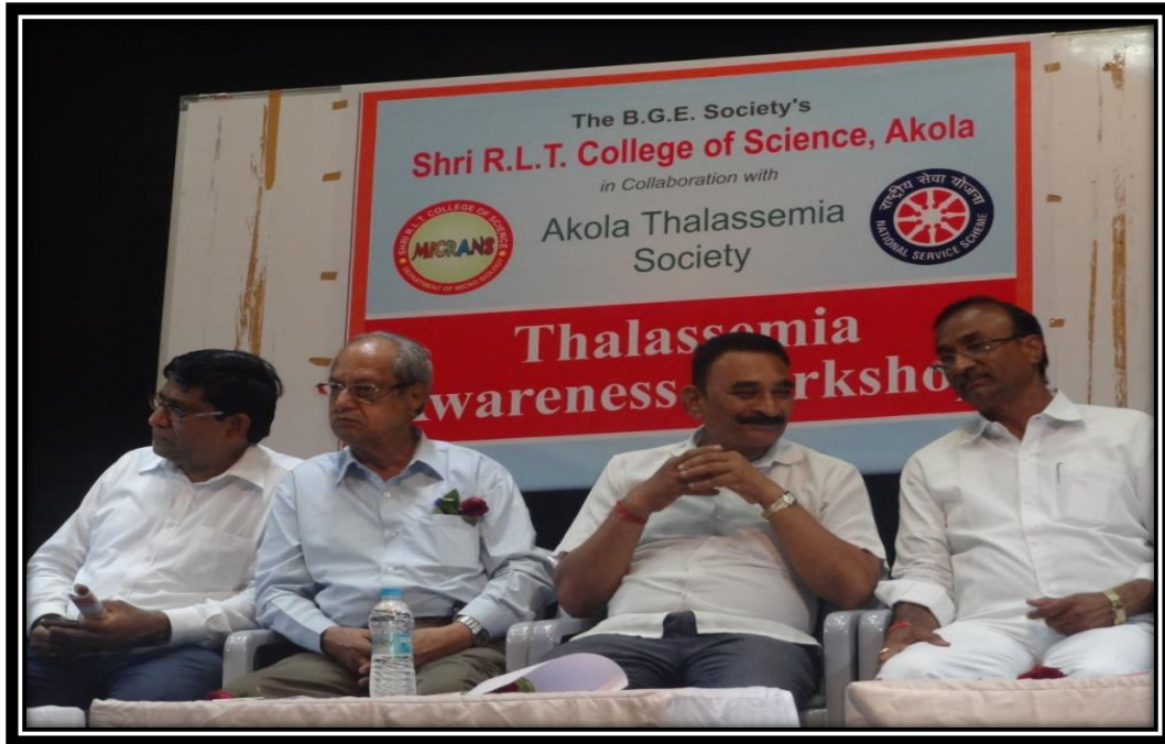
THALASSEMIA AWARENESS PROGRAM