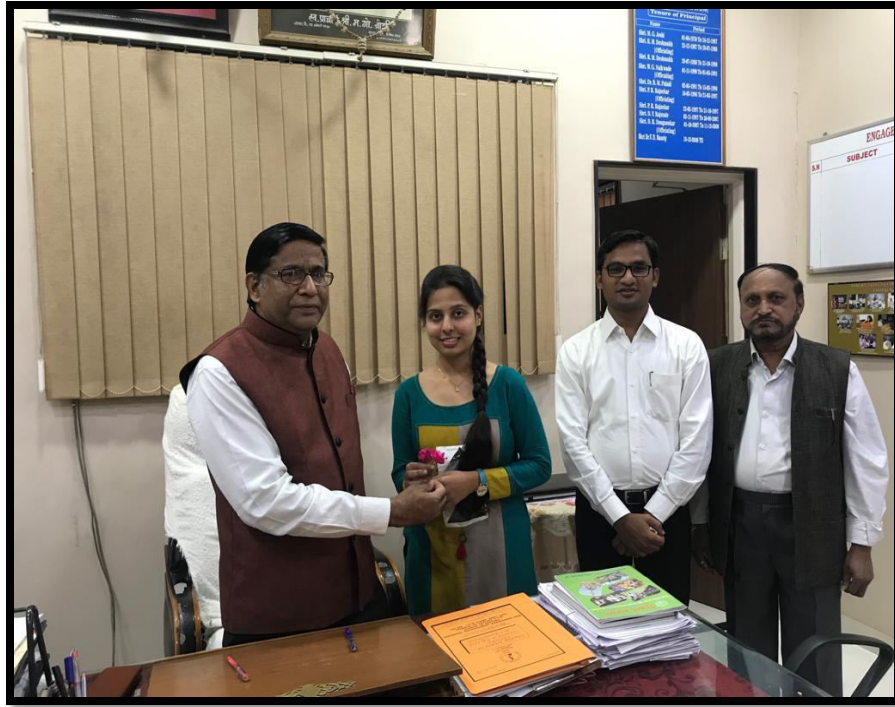
FELICITATION OF NET QUALIFIED STUDENT