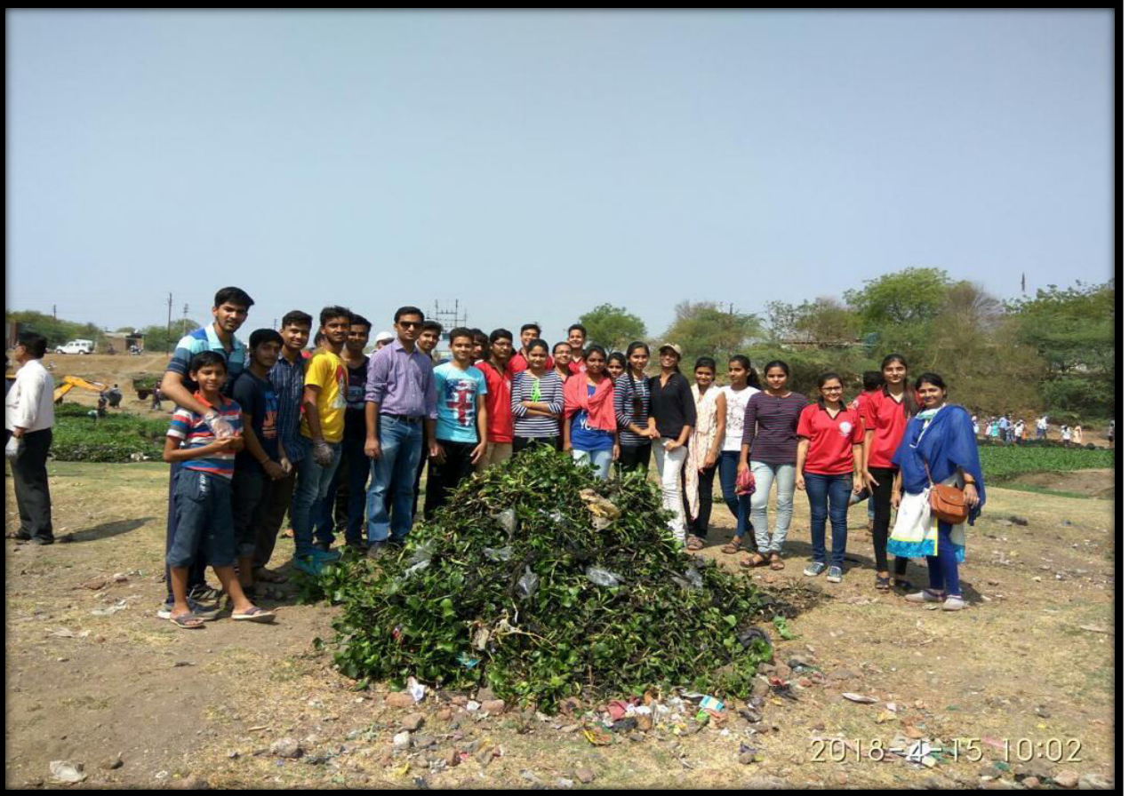
MORNA RIVER CLEANLINESS CAMPIAGN