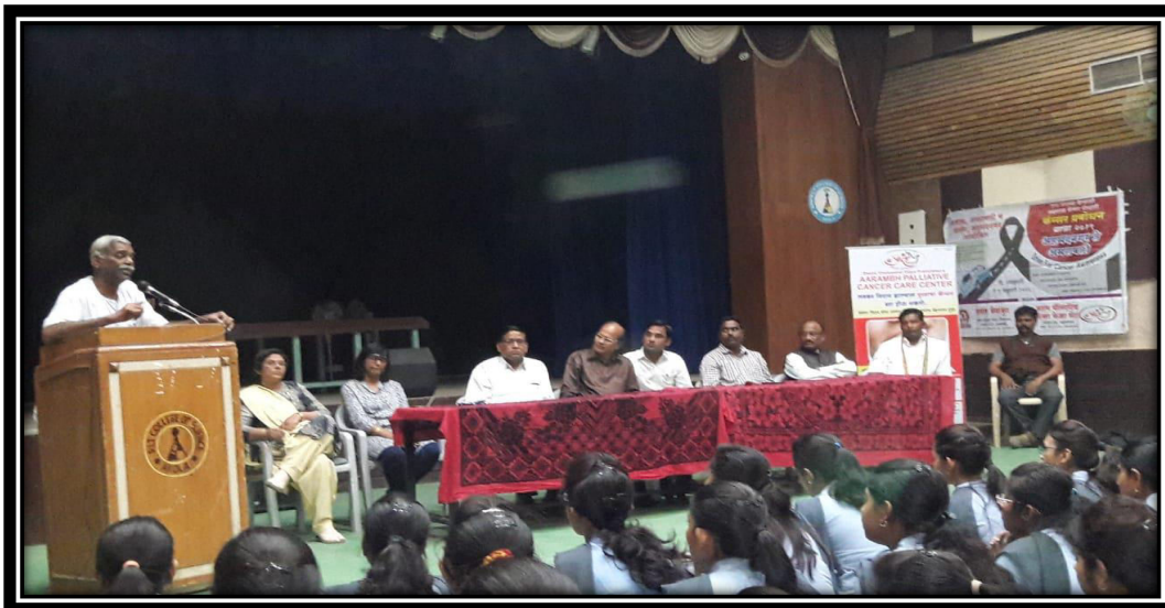
Issue Addressed: Health Awareness