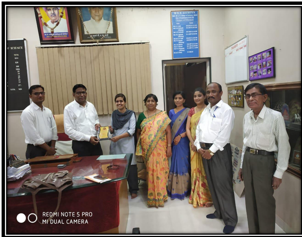
P. G. BEST STUDENT AWARD,(MSI)