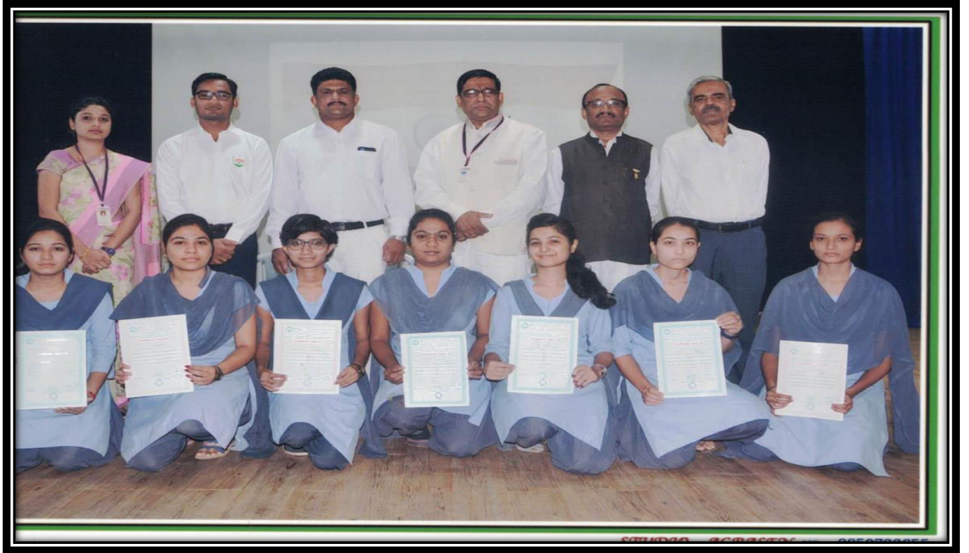
CCLT,DCLT EXAM CERIFICATE